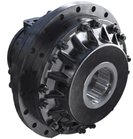
X - Series <