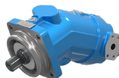
➤ SH11C - Fixed Displacement